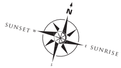
BEACH CLUB, 1ST FLOOR